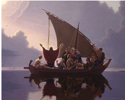
The LORD gives strength to his people; the LORD blesses his people with peace. Psalm 29:11

Q: Are you experiencing a true sense of peace because you know and follow Jesus, even when our world is possibly more of an anxious place than ever before?